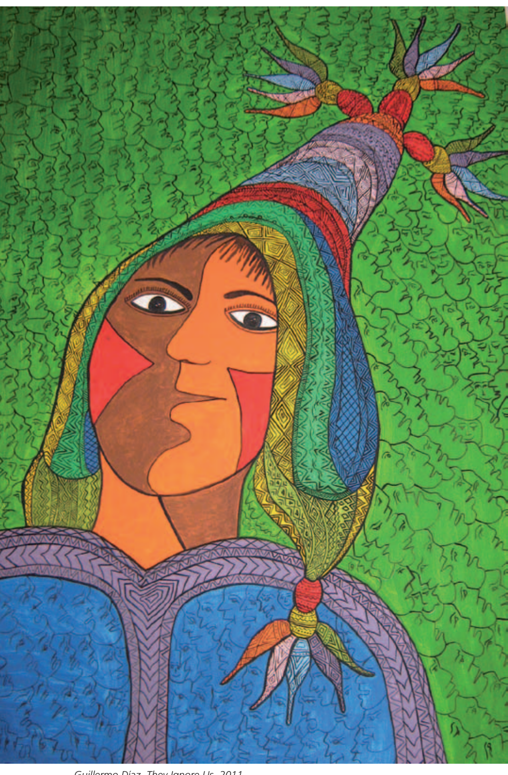
Guillermo Díaz. They Ignore Us. 2011