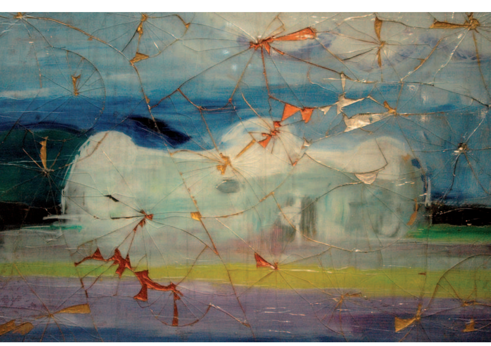
Jacqueline Page. The Palace. 2010